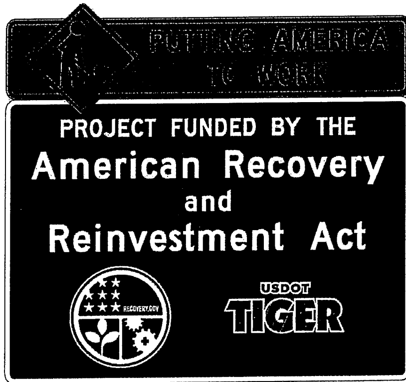
PROJECT FUNDING SOURCE SIGN ASSEMBLY