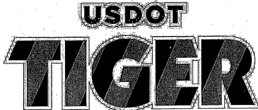
USDOT TIGER Vector Based, Vinyl Ready Photograph

COLORS: OUTLINE = WHITE (RETROREFLECTIVE) USDOT LEGEND = BLACK TIGER DIAGONALS = BLACK = ORANGE (RETROREFLECTIVE)