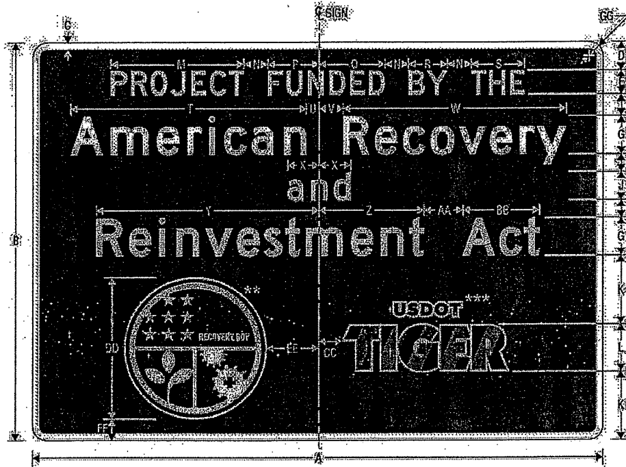
PROJECT FUNDING SOURCE SIGN

NOTE: SIGN SHALL NOT BE INSTALLED WITHOUT PROJECT FUNDING SOURCE PLAQUE