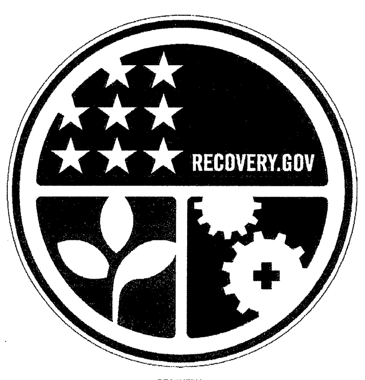
RECOVERY Vector-Based, Vinyl-Ready Pictograph