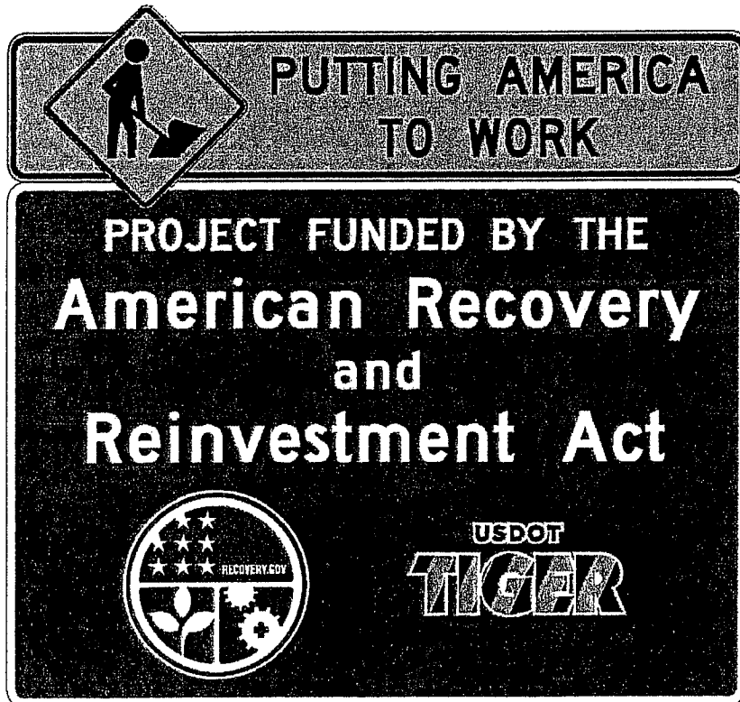
PROJECT FUNDING SOURCE SIGN ASSEMBLY