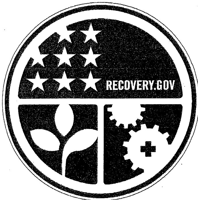
RECOVERY Vector-Based, Vinyl-Ready Pictograph

COLORS: LEGEND, OUTLINE - WHITE (RETROREFLECTIVE) BORDER - BLUE (RETROREFLECTIVE) BACKGROUND (UPPER) - BLUE (RETROREFLECTIVE) BACKGROUND (LOWER RIGHT) - RED (RETROREFLECTIVE) BACKGROUND (LOWER LEFT) - GREEN (RETROREFLECTIVE)