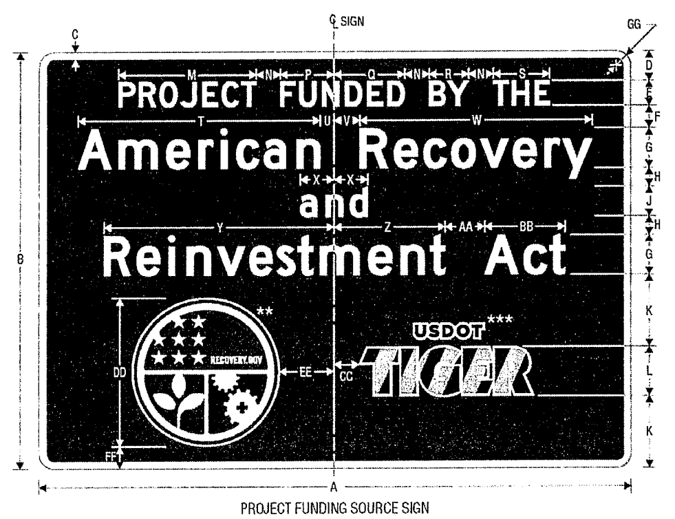
NOTE: SIGN SHALL NOT BE INSTALLED WITHOUT PROJECT FUNDING SOURCE PLAQUE