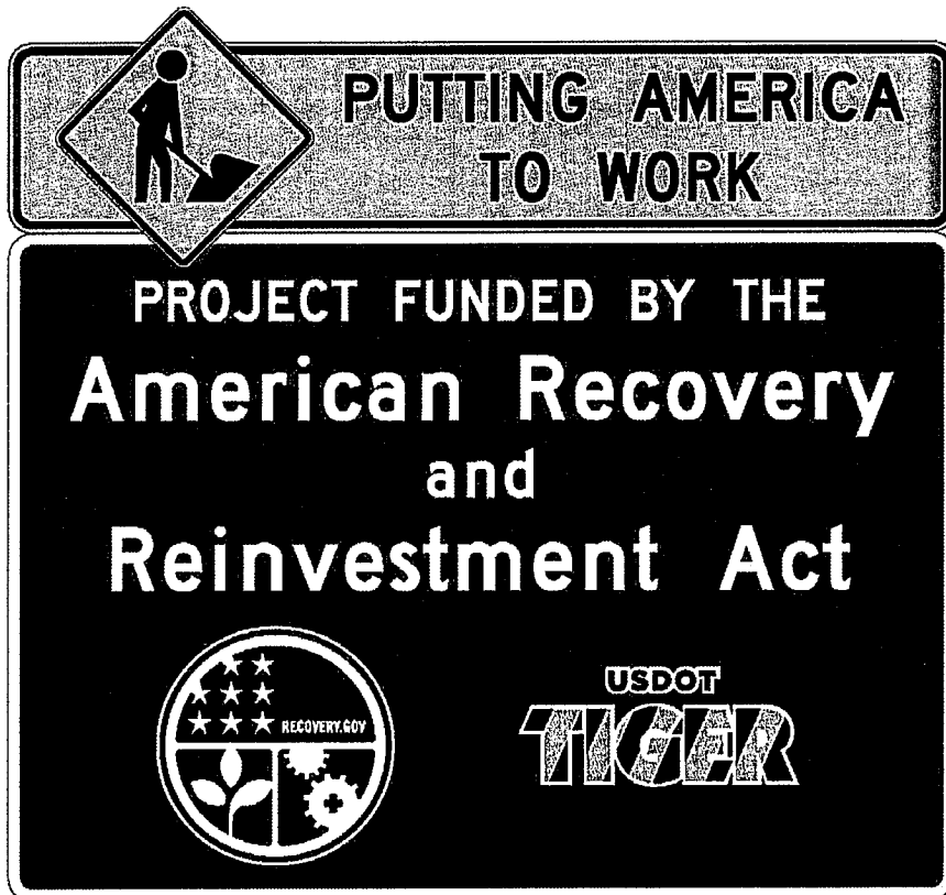
PROJECT FUNDING SOURCE SIGN ASSEMBLY