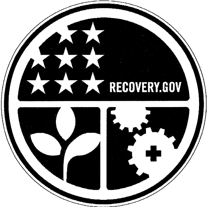
RECOVERY Vector-Based, Vinyl-Ready Pictograph