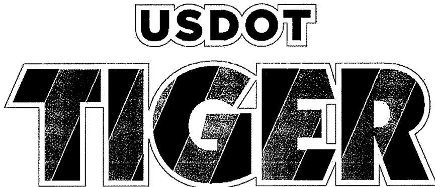
USDOT TIGER Vector-Based, Vinyl-Ready Pictograph

COLORS: OUTLINE - WHITE (RETROREFLECTIVE) USDOT LEGEND - BLACK TIGER DIAGONALS - BLACK, ORANGE (RETROREFLECTIVE)