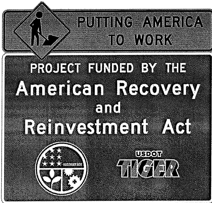
PROJECT FUNDING SOURCE SIGN ASSEMBLY