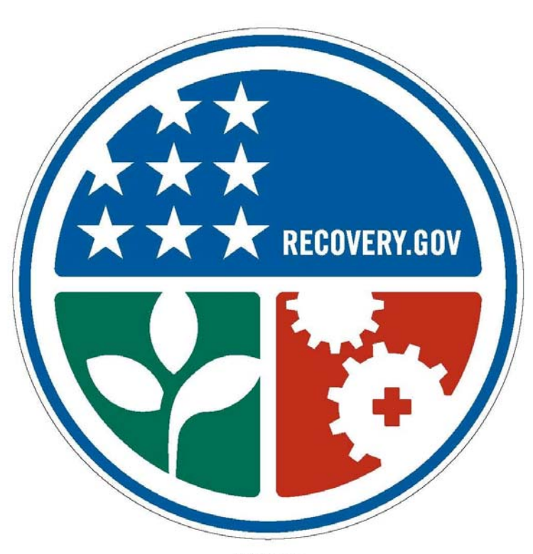
RECOVERY Vector-Based, Vinyl-Ready Pictograph

COLORS: LEGEND, OUTLINE — WHITE (RETROREFLECTIVE) BORDER — BLUE (RETROREFLECTIVE) BACKGROUND (UPPER) — BLUE (RETROREFLECTIVE)