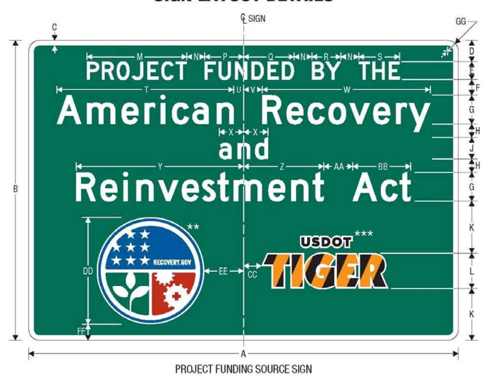
NOTE: SIGN SHALL NOT BE INSTALLED WITHOUT PROJECT FUNDING SOURCE PLAQUE