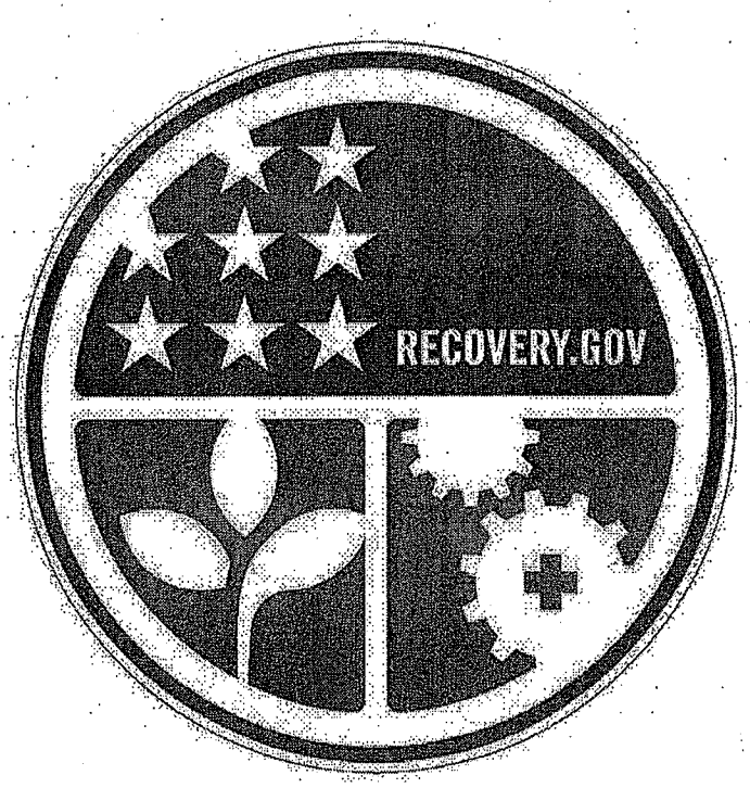
RECOVERY Vector-Based, VinyEReady Pictograph

COLORS: LEGEND, OUTLINE — WHITE (RETROREFLECTIVE) BORDER — BLUE (RETROREFLECTIVE) BACKGROUND (UPPER) — BLUE (RETROREFLECTIVE) BACKGROUND (LOWER RIGHT) — RED (RETROREFLECTIVE) BACKGROUND (LOWER LEFT) — GREEN (RETROREFLECTIVE)