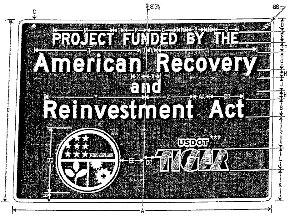
PROJECT FUNDING SOURCE SIGN

NOTE: SIGN SHALL NOT BE INSTALLED WITHOUT PROJECT FUNDING SOURCE PLAQUE