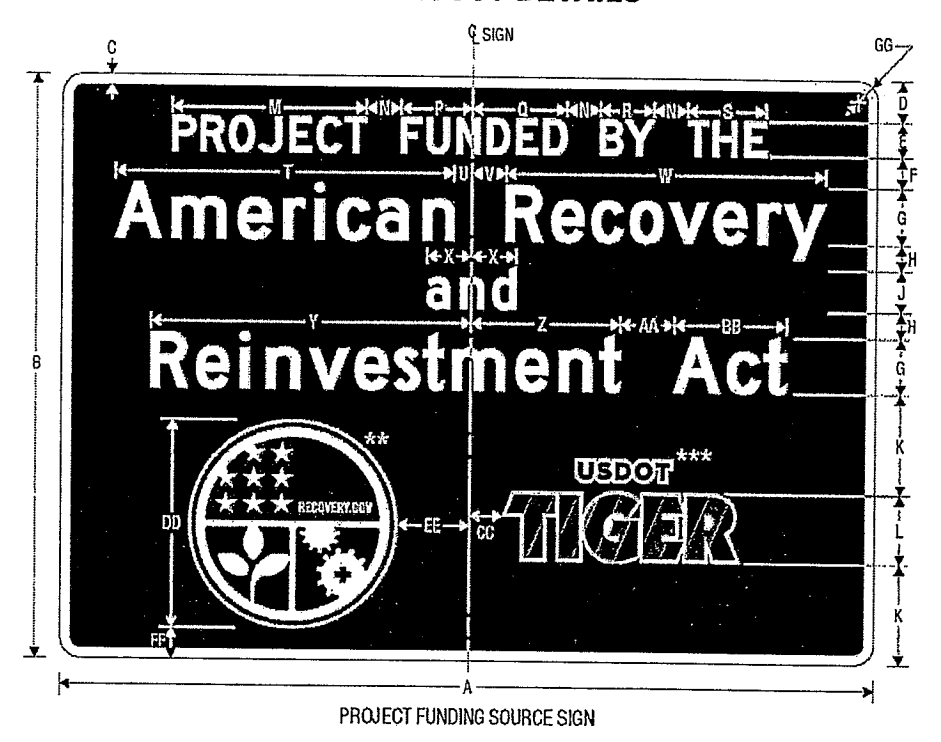
NOTE: SIGN SHALL NOT BE INSTALLED WITHOUT PROJECT FUNDING SOURCE PLAQUE