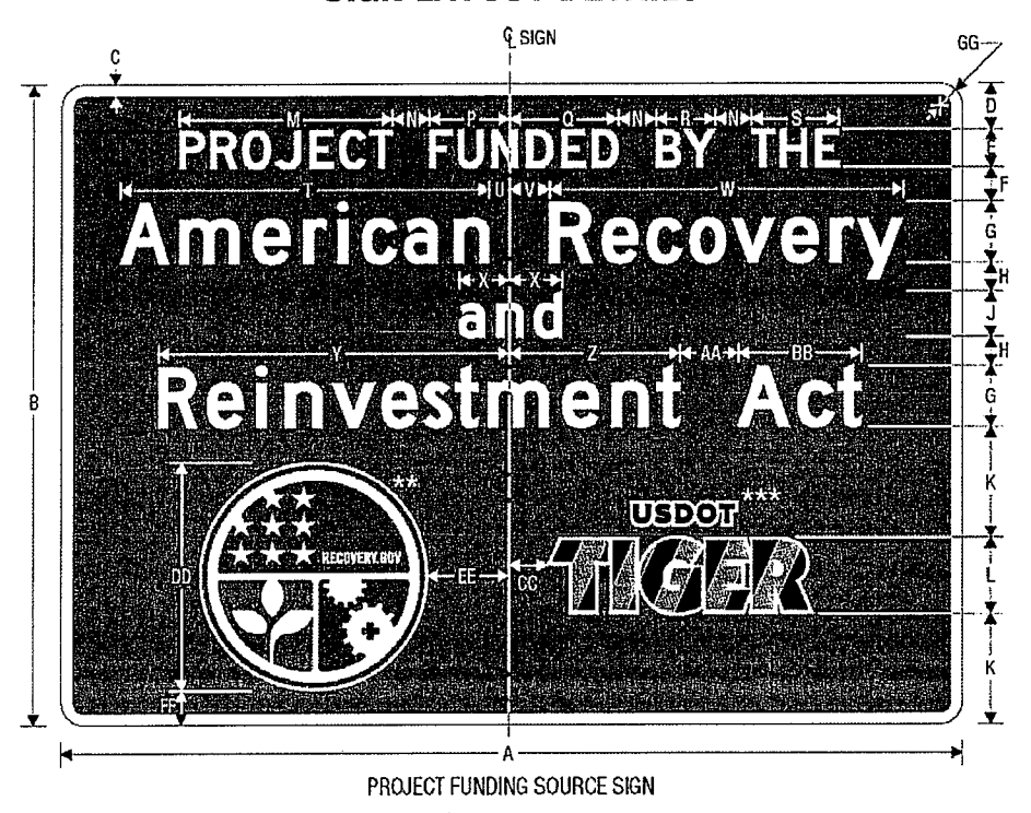
NOTE: SIGN SHALL NOT BE INSTALLED WITHOUT PROJECT FUNDING SOURCE PLAQUE