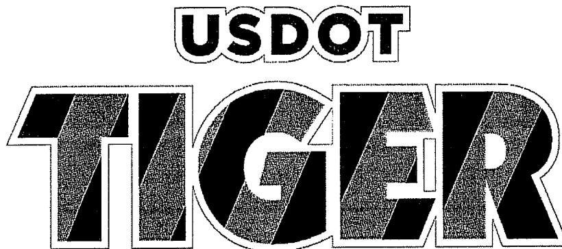
USDOT TIGER Vector-Based, Vinyl-Ready Pictograph

COLORS: OUTLINE — WHITE (RETROREFLECTIVE) USDOT LEGEND — BLACK TIGER DIAGONALS — BLACK, ORANGE (RETROREFLECTIVE)