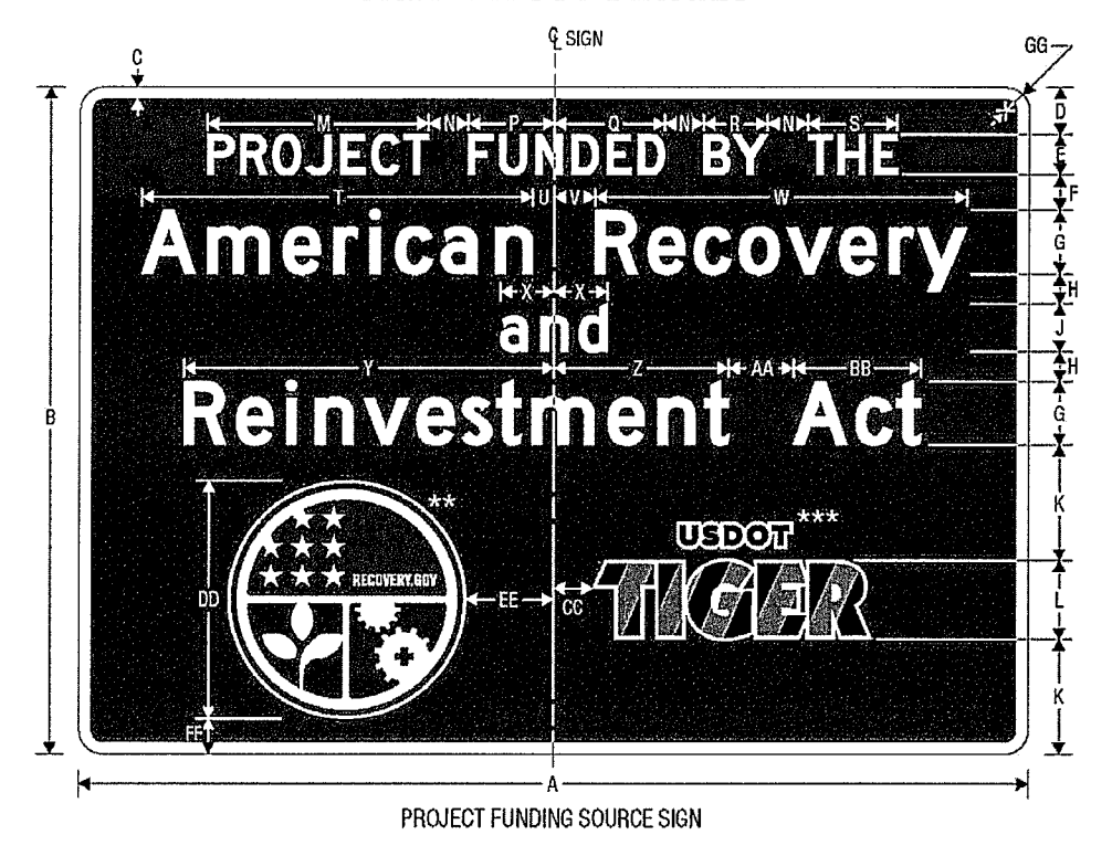
NOTE: SIGN SHALL NOT BE INSTALLED WITHOUT PROJECT FUNDING SOURCE PLAQUE