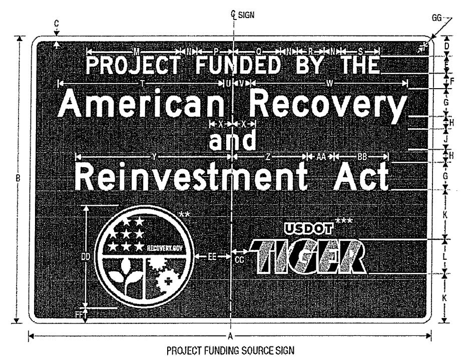
NOTE: SIGN SHALL NOT BE INSTALLED WITHOUT