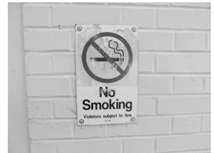
12 SIGNAGE 2545 SCALE: NTS