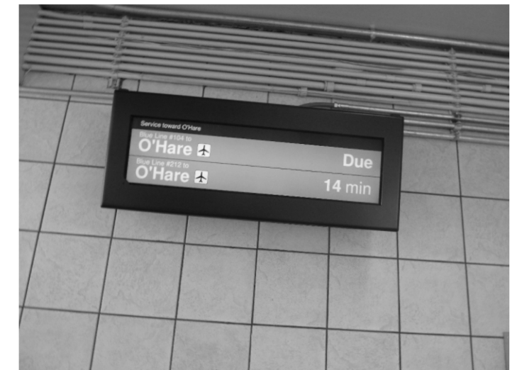
8 SIGNAGE 2536 SCALE: NTS