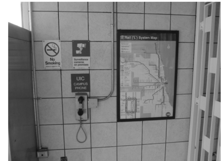
4 SIGNAGE 2522 SCALE: NTS