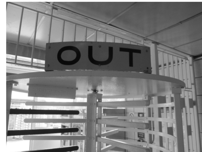
7 SIGNAGE 2534 SCALE: NTS