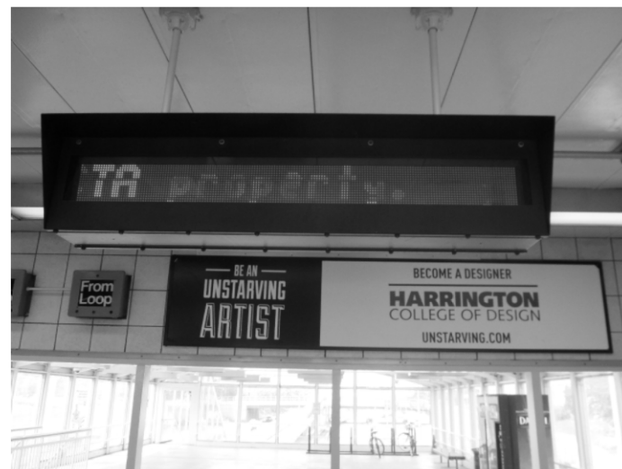
10 SIGNAGE 2539 SCALE: NTS