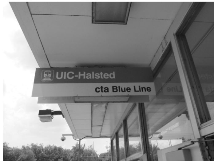
1 SIGNAGE 2502 SCALE: NTS