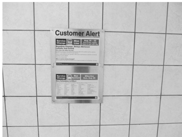
9 SIGNAGE 2538 SCALE: NTS