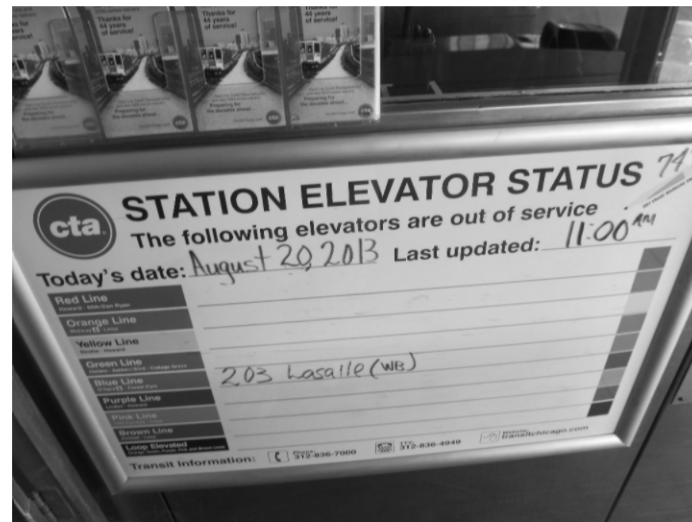
6 SIGNAGE 2530 SCALE: NTS