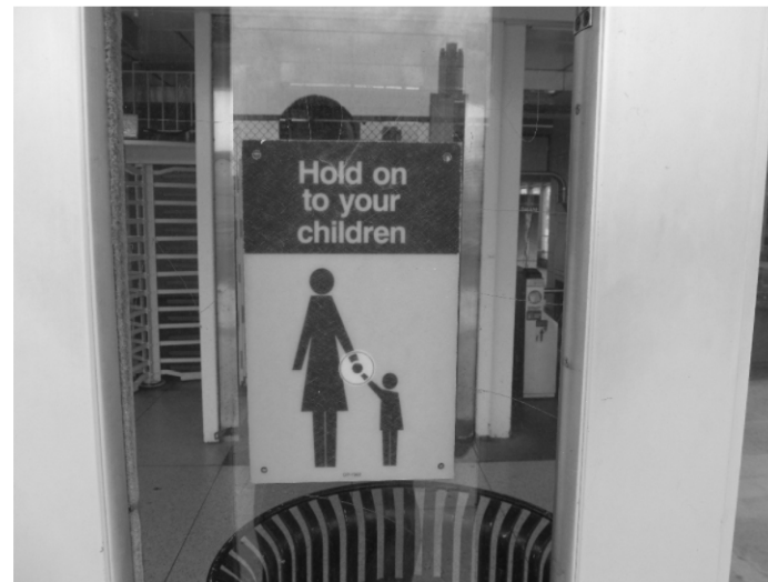
2 SIGNAGE 2514 SCALE: NTS