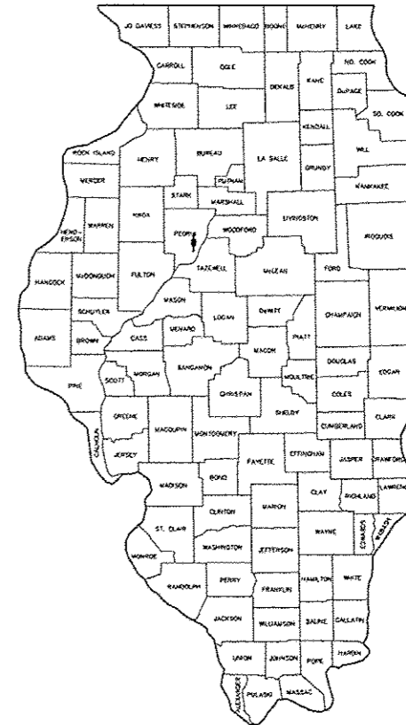
LOCATION OF PROPOSED IMPROVEMENT