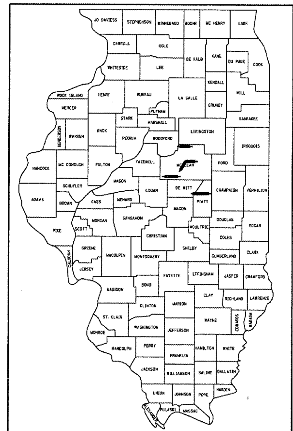
LOCATION OF SECTION INDICATED THUS: - [shaded box] -