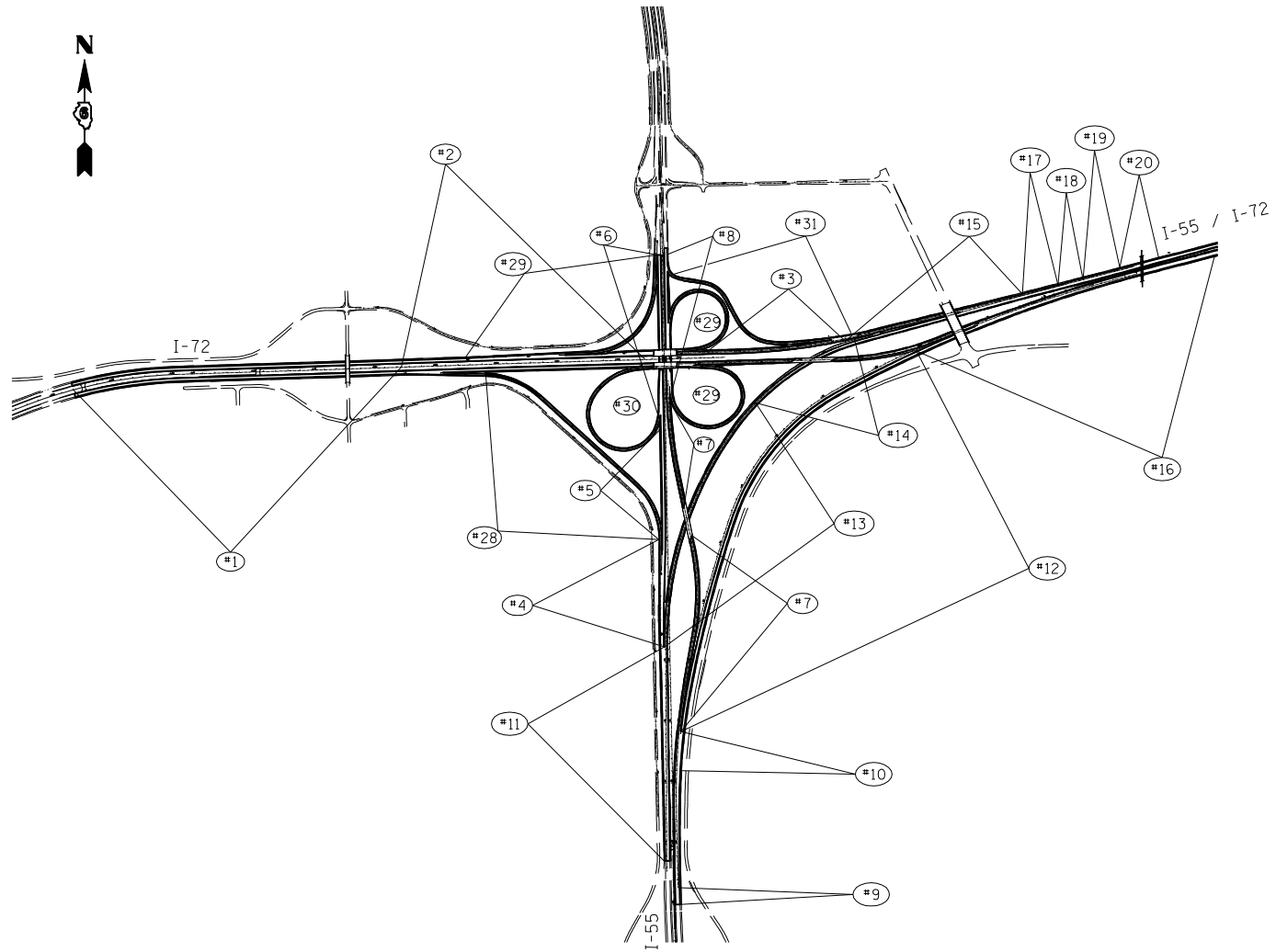
6TH STREET INTERCHANGE