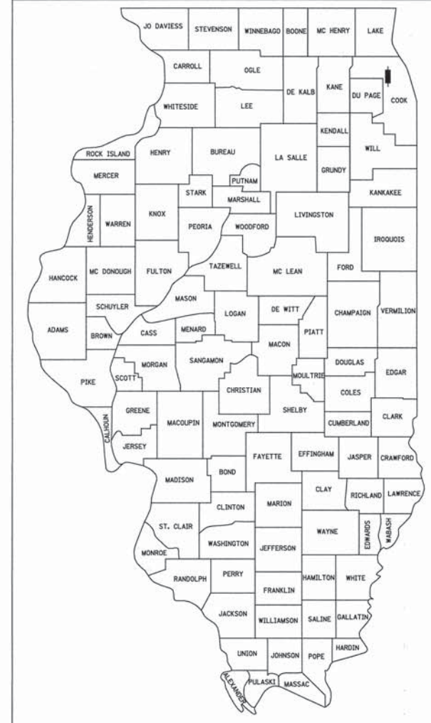
LOCATION OF SECTION INDICATED THUS: - [black rectangle]

LIMITS: MANNHEIM ROAD - 174+99.00 TO 193+90.23 LAWRENCE ROAD - 12+33.72 TO 15+94.26