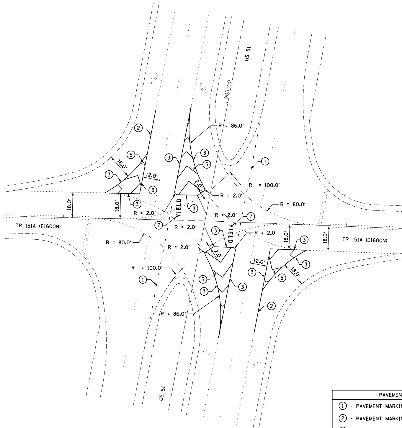
US 51 & TR 151A /E1600N PLAN VIEW