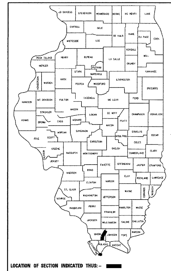
LOCATION OF SECTION INDICATED THUS: - [black rectangle]