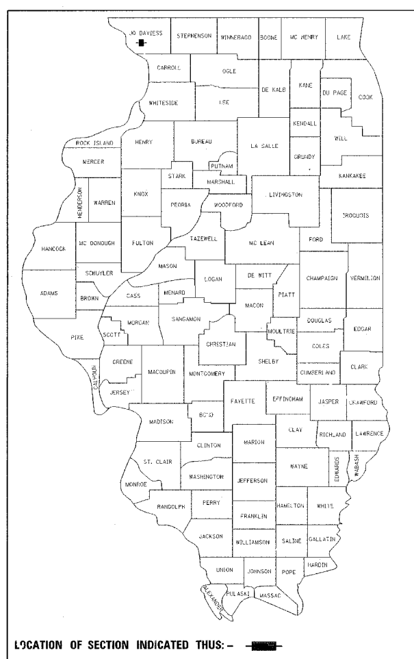
LOCATION OF SECTION INDICATED THUS: - [shaded area] -