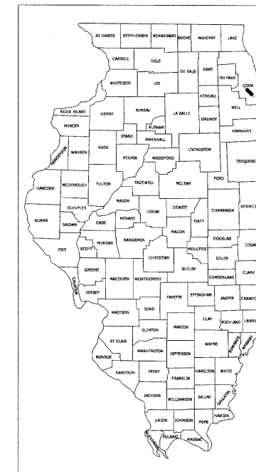
LOCATION OF SECTION INDICATED THUS:

PROJECT ENDS STATION 66+50 GRAND BOULEVARD