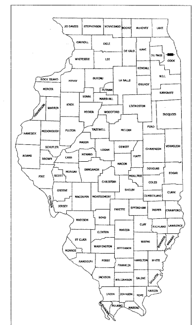
LOCATION OF SECTION INDICATED THIS:

ILLINOIS PROJECT M-TE-00D1(825) CONTRACT NO. 63654