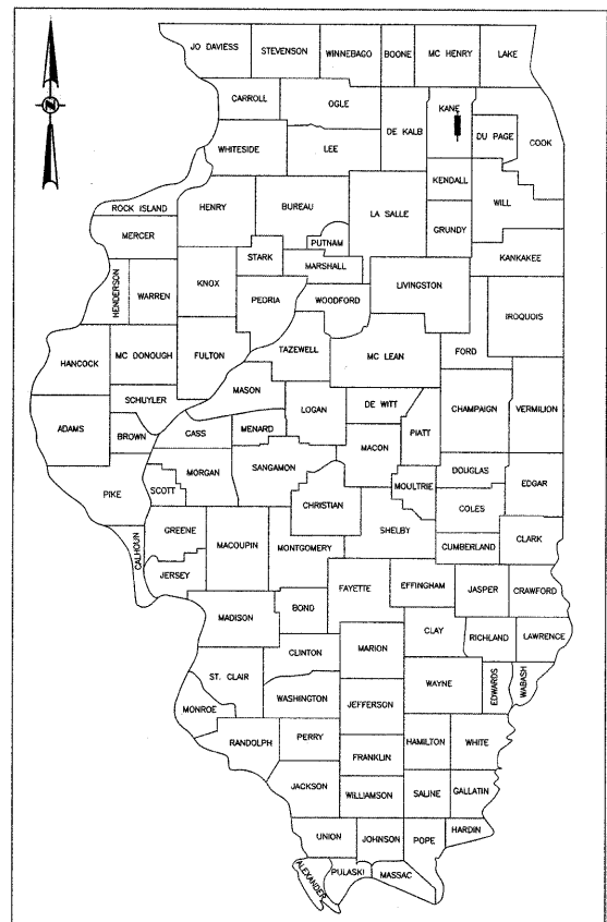
LOCATION OF SECTION INDICATED THUS: — PRINTED BY THE AUTHORITY OF THE STATE OF ILLINOIS

FULL SIZE PLANS HAVE BEEN PREPARED USING STANDARD ENGINEERING SCALES. REDUCED SIZED PLANS WILL NOT CONFORM TO STANDARD SCALES. IN MAKING MEASUREMENTS ON REDUCED PLANS, THE ABOVE SCALES MAY BE USED.