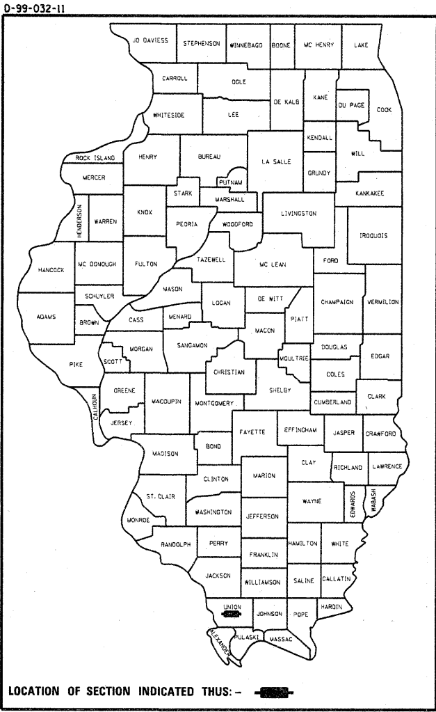
LOCATION OF SECTION INDICATED THUS: - [shaded rectangle] -