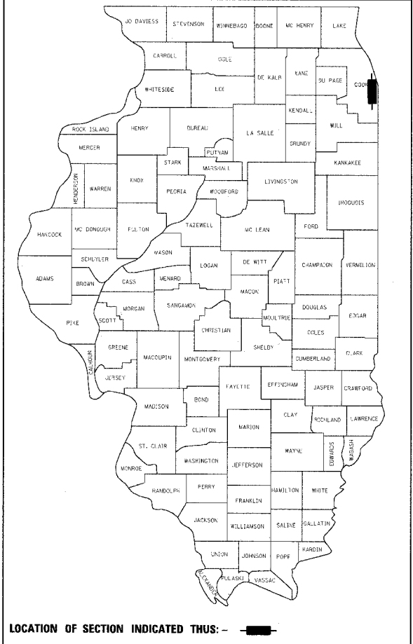
LOCATION OF SECTION INDICATED THIS: -