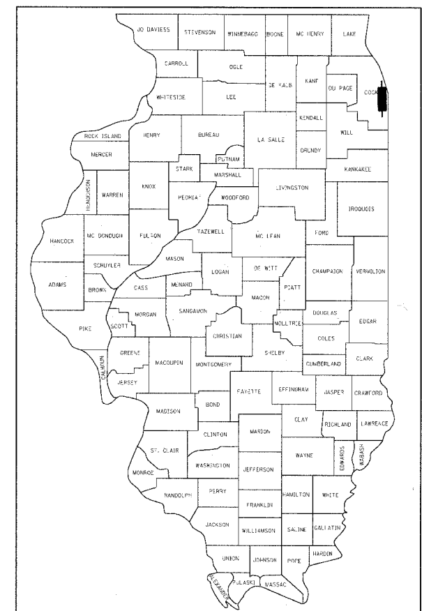
LOCATION OF SECTION INDICATED THUS: - [black bar] -