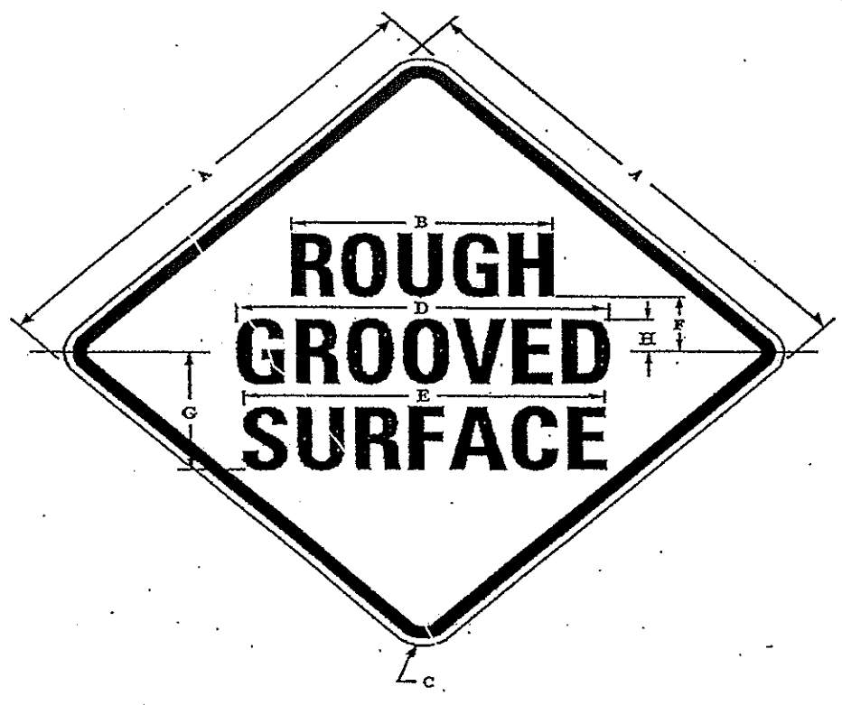
COLOR: LEGEND AND BORDER — BLACK NON-REFLECTORIZED BACKGROUND — CRANGE REFLECTORIZED