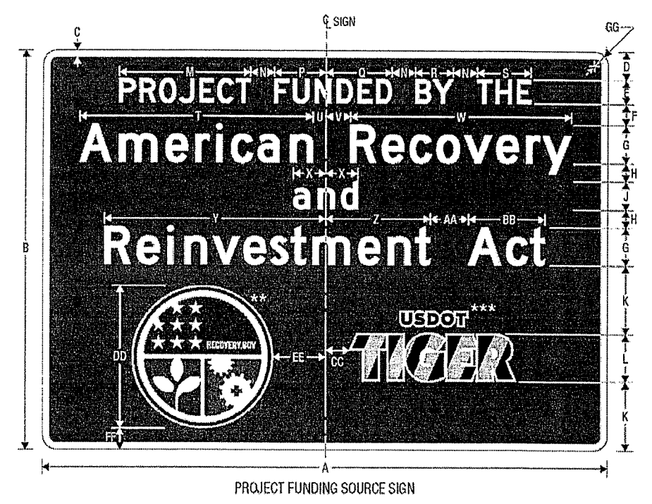
NOTE: SIGN SHALL NOT BE INSTALLED WITHOUT PROJECT FUNDING SOURCE PLAQUE