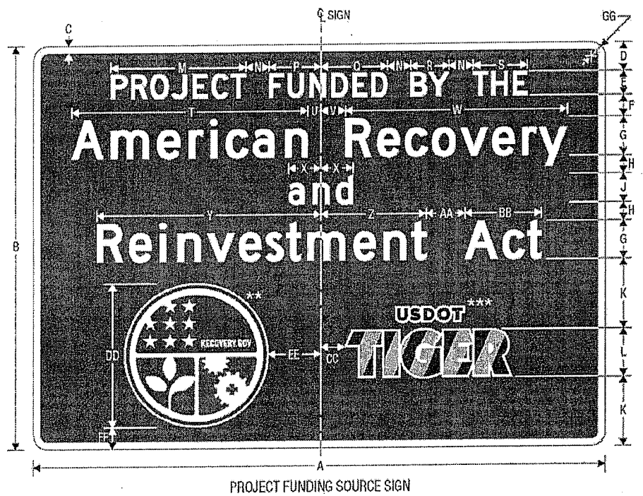
NOTE: SIGN SHALL NOT BE INSTALLED WITHOUT