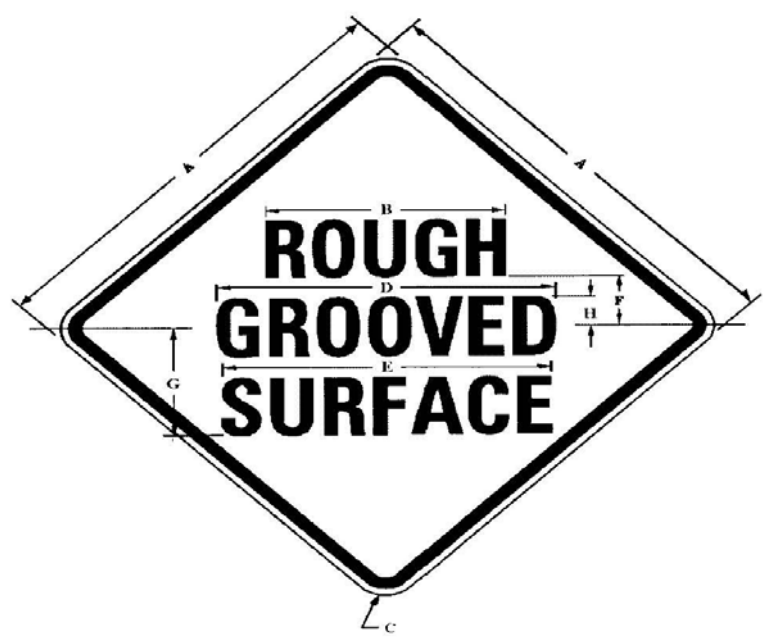
COLOR: LEGEND AND BORDER — BLACK NON-REFLECTORIZED BACKGROUND — ORANGE REFLECTORIZED