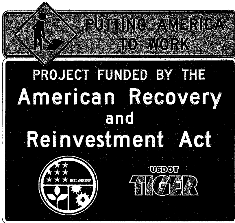
PROJECT FUNDING SOURCE SIGN ASSEMBLY