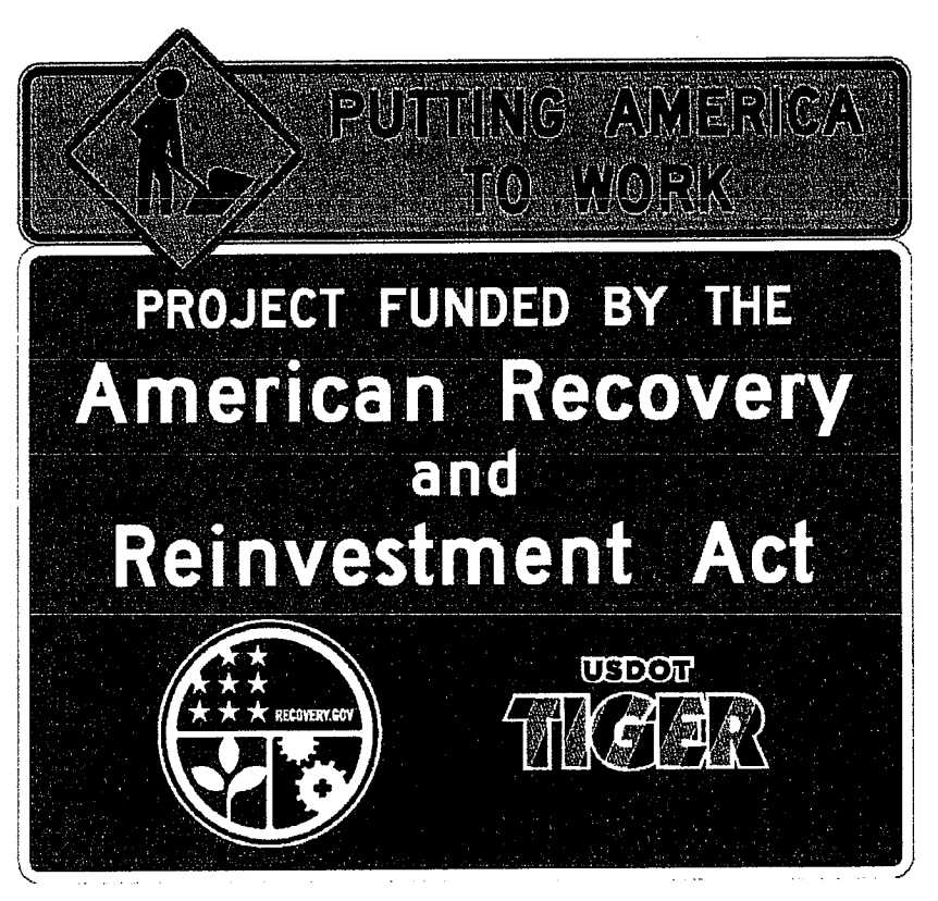
PROJECT FUNDING SOURCE SIGN ASSEMBLY