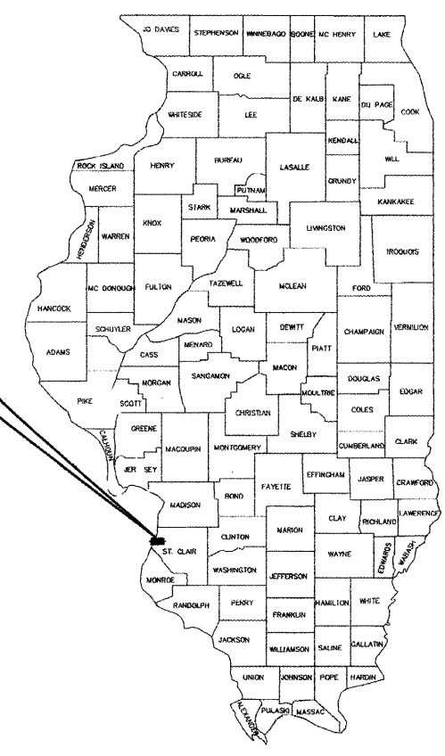
ST. CLAIR COUNTY LOCATION OF SECTION INDICATED THUS -

FAU ROUTE 9199 (DORIS AVENUE RESURFACING) CITY SECTION 09-00044-00-RS PROJECT NO. ARA-5011 (287) JOB NO. C-98-369-09 ST. CLAIR COUNTY