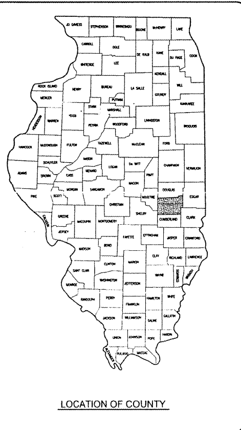
LOCATION OF COUNTY