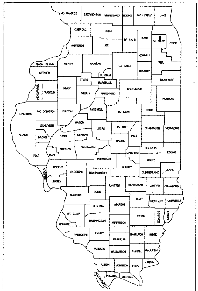
LOCATION OF SECTION INDICATED THIS: — ■ —

LOCATION MAP (NOT TO SCALE) R:9E PROJECT ENDS STA. 166+22