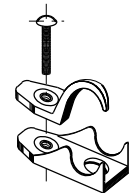
PVC COATED CONDUIT CLAMP NOT TO SCALE