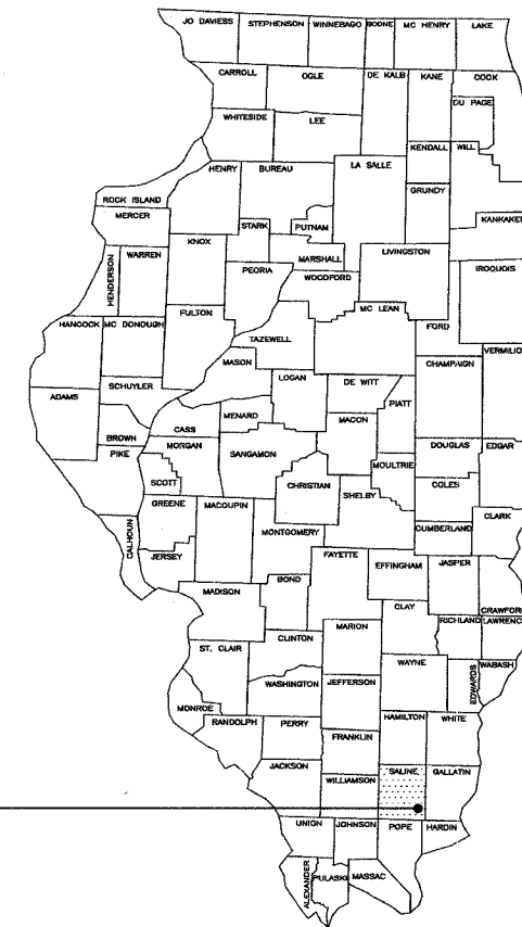
Marshall Equipment - Phase V Saline County

Marshall Equipment -- Phase V Reclamation Project AML-GSIE-0417 Saline County 2LR