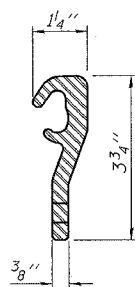
LOCKING EDGE RAIL