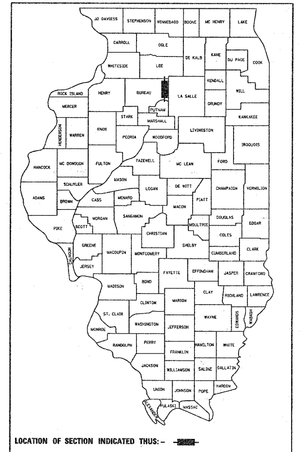
LOCATION OF SECTION INDICATED THUS: - [shaded box] -

2006 ADT: WEST OF STRONG STREET 7600VPD 3.3% MU 4.3% SU 92.4%PV EAST OF STRONG STREET 12000VPD 1.5%MU 5.4% SU 93.1%PV