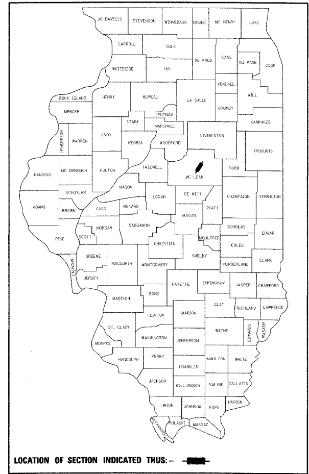
LOCATION OF SECTION INDICATED THUS: —