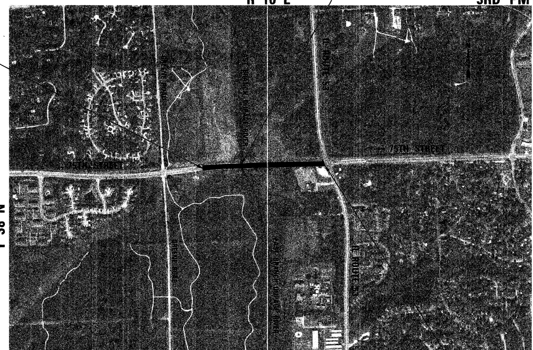
LISLE TOWNSHIP LOCATION MAP SCALE 1" = 500'

GROSS LENGTH 75TH STREET = 2,269.45 FEET (0.43 MILES) NET LENGTH 75TH STREET = 2,269.45 FEET (0.43 MILES)