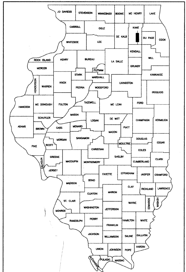
LOCATION OF SECTION INDICATED THUS: — ■ —

TRAFFIC DATA ADT (2005) = 8,900-11,500 POSTED SPEED 30 MPH DESIGN SPEED 35 MPH FUNCTIONAL CLASSIFICATION: COLLECTOR