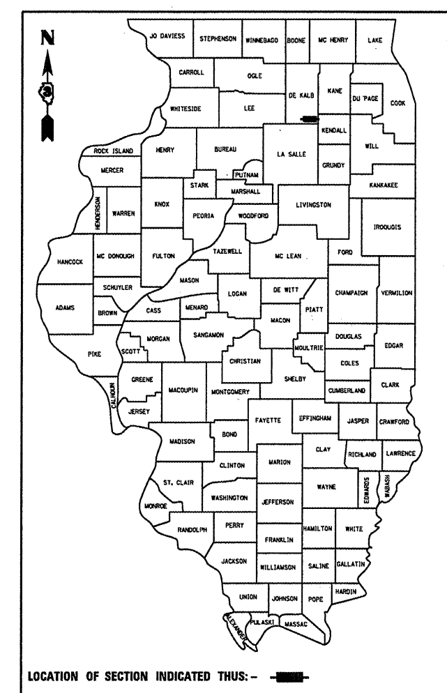
LOCATION OF SECTION INDICATED THUS: - ■ -