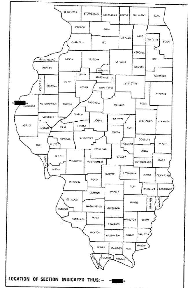
LOCATION OF SECTION INDICATED THUS: - [black rectangle]