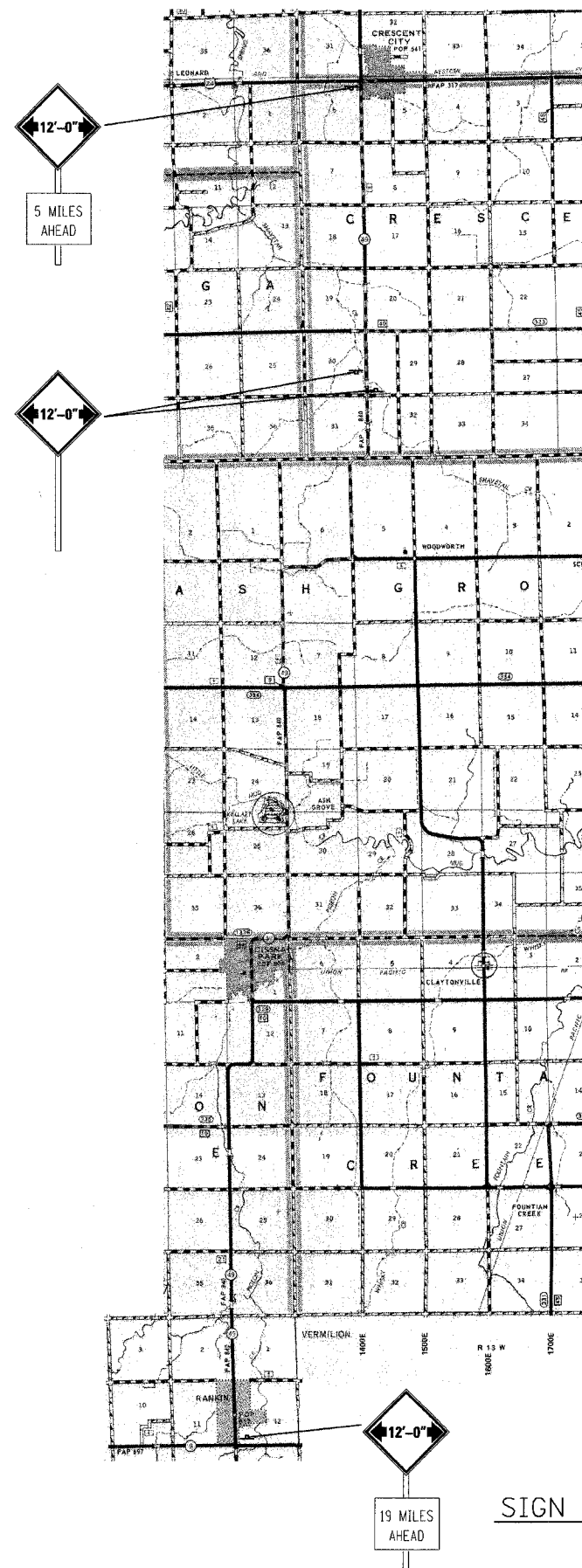
SIGN LOCATION PLAN