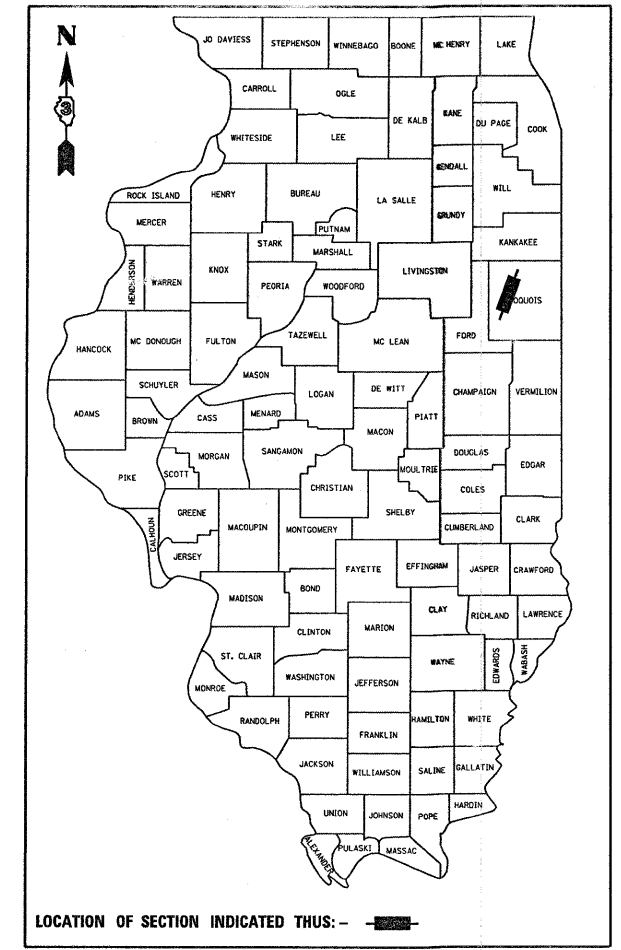
LOCATION OF SECTION INDICATED THUS: -

RESURFACING OF IL 54 FROM I-57 TO NORTH OF THAWVILLE