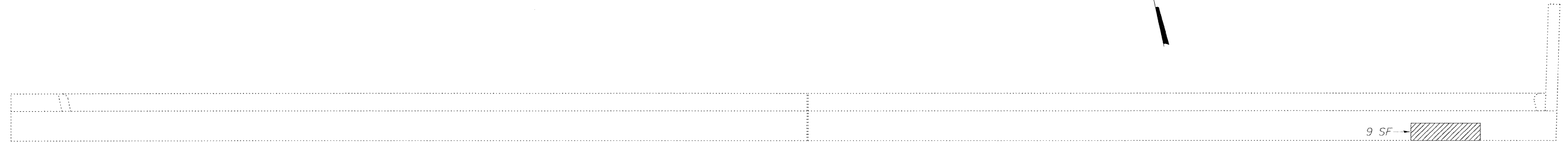
NORTH ABUTMENT PLAN